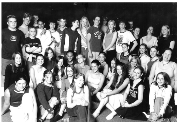
Guys & Dolls 2003