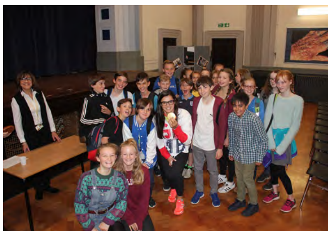
Inspiring the current students of High Storrs