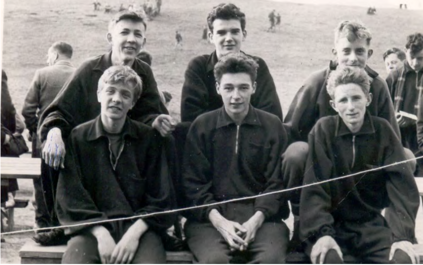
N Schools Champions Lyme Park Disley 1956

In the late Spring of 1949, my father and I set out one evening on a journey of great significance. Our ascending steps took us up Sharrow Lane, Psalter Lane, Ecclesall Road and then, the final assault, Ringinglow Road itself with High Storrs at its apex. This was my school of choice, picked unseen, by me and my wondering family. My father never did see it again, nor my mother or brother. The 1944 Education Act tripartite model of Grammar,