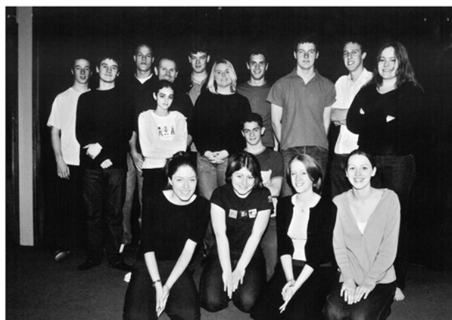
The Plough & The Stars 1999