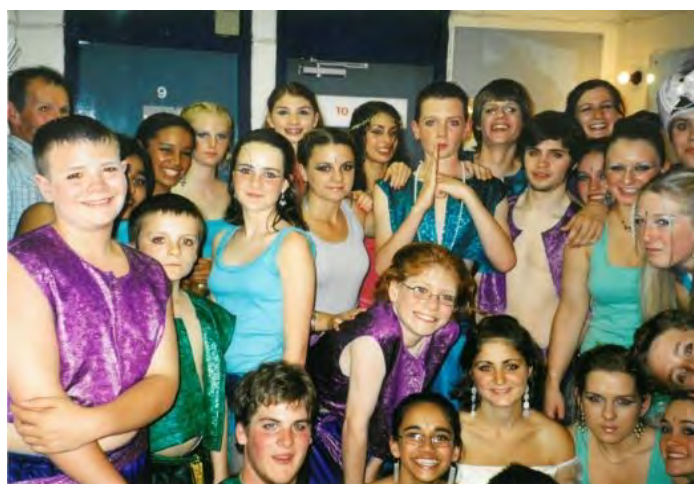
Arabian Nights 2004